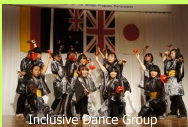
Inclusive Dance Group

at sharing skills and knowledge to develop all involved, particularly leaders of Japanese organisations as the voluntary sector is newly developing in Japan. Emily worked closely with an international group looking at setting up new projects, and the project management needed to make these as successful as possible.