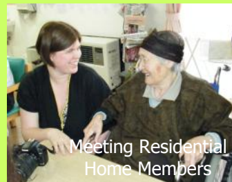
Meeting Residential Home Members